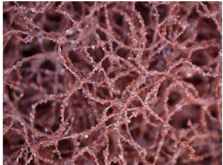
Maroon X Microscopic Picture